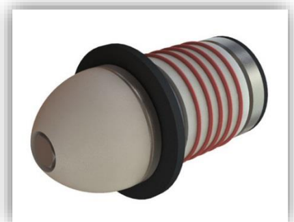
Fig.2 Coupling Mini Adjustable